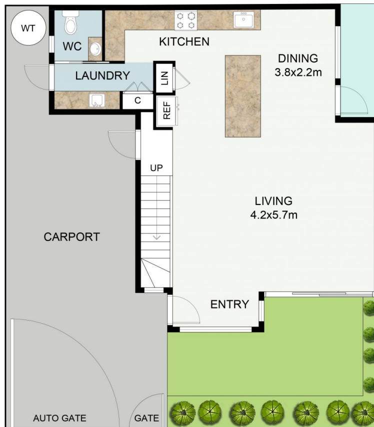
GROUND FLOOR PLAN ON SITE

This floor plan including furniture, fixture measurements and dimensions are approximate and for illustrative purposes only. Boxbrownie.com gives no guarantee, warranty or representation as to the accuracy and layout. All enquiries must be directed to the agent, vendor or party representing this floor plan.