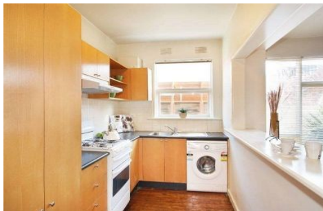
18/8 St. Leonards Avenue, St. Kilda